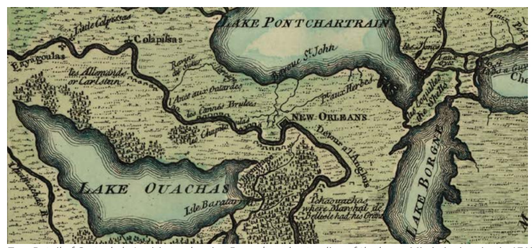
Top: Detail of Carte de la Louisiane, showing France's understanding of the lower Mississippi region in 1718. Bottom: Detail from Plan of New Orleans, published 1759 depicting 1720 conditions.