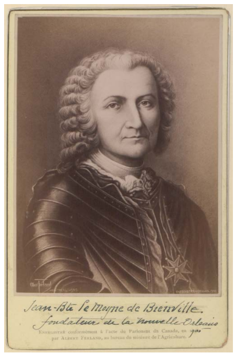
Bienville in his later years

1699 Iberville, Bienville and their crew reconnoiter the lower Mississippi and pass the future New Orleans site in early March, aiming to establish an outpost. But flummoxed by the uncontrolled river and the low, swampy